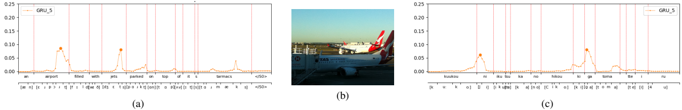
Fig. 2: Attention weights over an English (2a) and Japanese caption (2c), both describing the same picture (2b). Attention peaks in the English caption are located above “AIRPORT” and “JETS”. Attention peaks in the Japanese caption are located above “NI” (particle indicating location) and “GA” (particle indicating the subject of the sentence). Red dotted lines show token boundaries. Large orange markers show automatically detected peaks. Japanese caption reads: “Several planes are stopped at the airport”